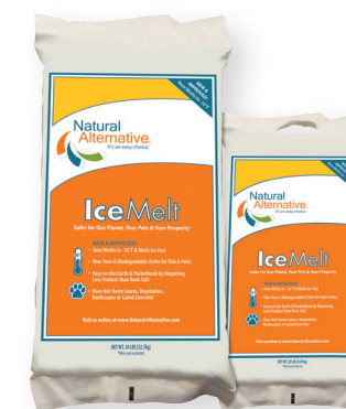
20 lb. or 50 lb. Bag