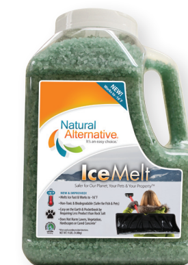
9 lb. Shaker Jug

Natural Alternative® Ice Melt Comes in a Variety of Sizes for Your Convenience.