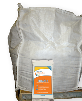
1 Ton Super Sack